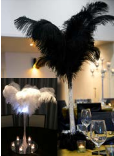
A tall Eifel vase filled with white or black Ostrich Feathers, sitting on a mirror, surrounded by tea light candles