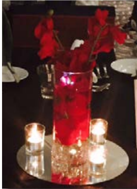
A Cylinder Vase filled with artificial Singapore Orchids sitting on a mirror with tea light candles surrounding