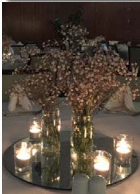
Mason Jars filled with Baby's Breath sitting on a mirror (or timber disk) surrounded by tea light candles