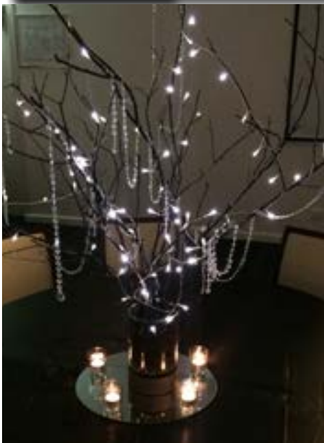
A Cylinder vase filled with black pebbles, and filled with sticks (gold or natural), with fairy lights or hanging crystals or hanging tea lights sitting on a mirror surrounded by tea light candles